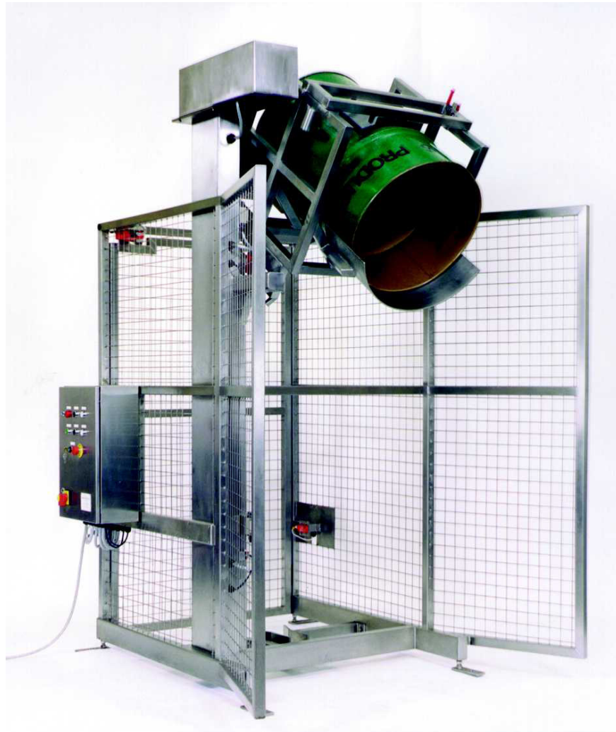
45 Gallon Drum Tipper

This 45 Gallon drum tipper is a single pillar drum tipper that is designed to lift and tip at a discharge height of 1400mm. The 45 Gallon drum tipper is constructed from Grade 304 stainless steel, is fully TIG welded throughout and will operate on a 'dead mans handle' principle. Lifting with the 45 Gallon drum tipper is achieved by a 3/4" Simplex chain driven by a motor gearbox mounted at the top of the main column. The 45 Gallon drum tipper is designed to be bolted to the floor.