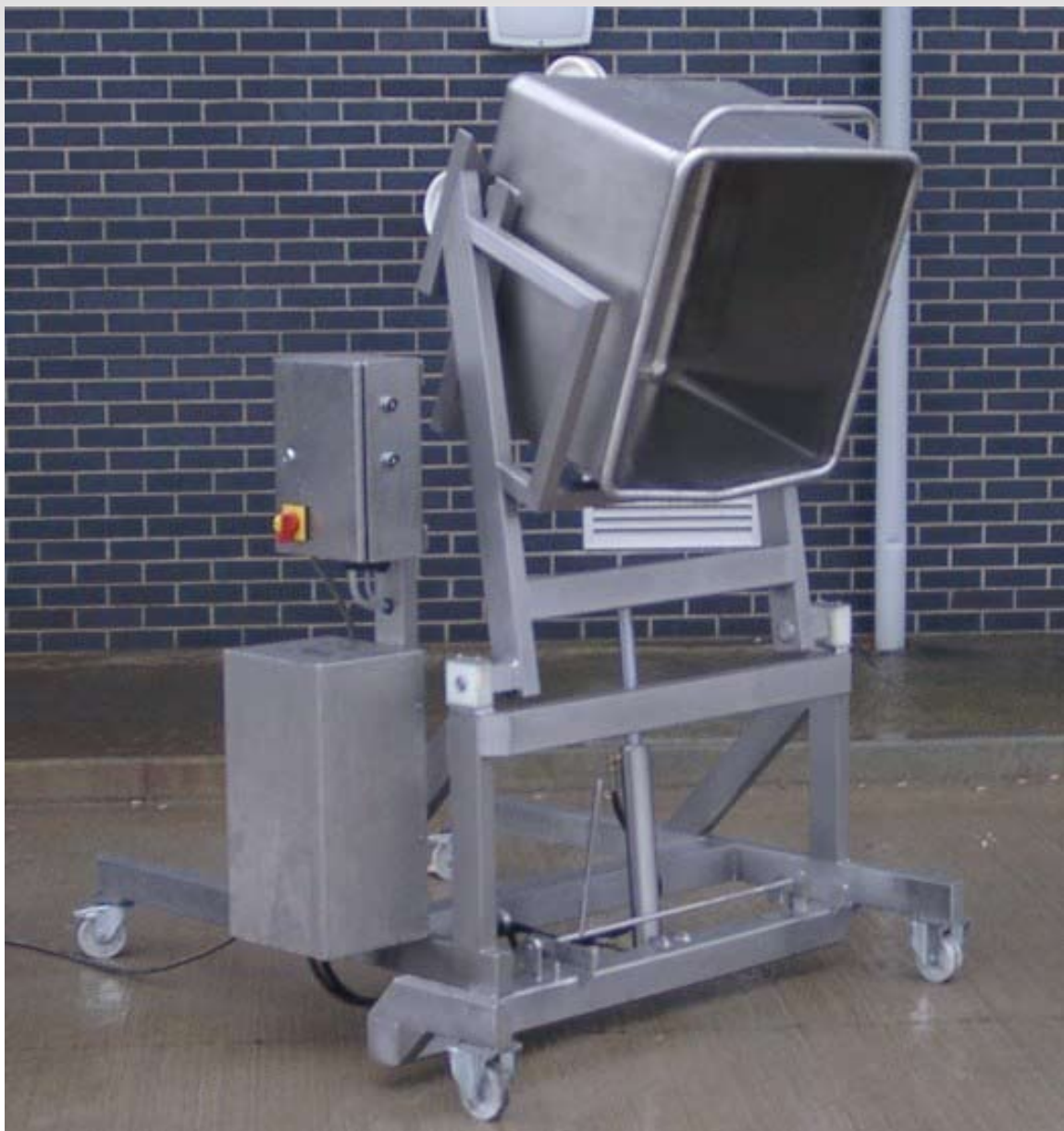
Hydraulic Bin Lift for 200 Litre Tote Bin

The hydraulic bin lift is designed to lift and tip a standard 200 Litre tote bin at a height of 1000mm. The hydraulic bin lift is constructed from Grade 304 stainless steel and is a fully TIG welded construction throughout. This hydraulic bin lift would be powered via a hydraulic power pack and would tip the containers by the extension of a stainless steel hydraulic cylinder. The hydraulic bin lift will operate on a 'dead mans handle' principle and is mobile on two fixed and two swivel braked castors. The hydraulic cylinder will be fitted with a hydraulic fuse to prevent the bin from falling in the unlikely event of a hose failure.