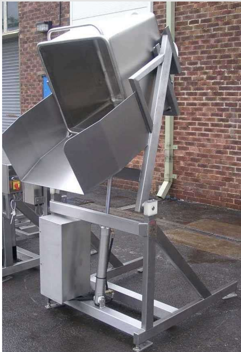
Hydraulic Bin Tipper for 200 Litre Tote Bin

This hydraulic bin tipper is designed to lift and tip a standard 200 Litre tote bin at a height of 1200mm. The hydraulic bin tipper is constructed from Grade 304 stainless steel and is a fully TIG welded construction throughout. This hydraulic bin tipper would be powered via a hydraulic power pack and would tip the containers by the extension of a stainless steel hydraulic cylinder. The hydraulic bin tipper will operate on a 'dead mans handle' principle and would be bolted to the floor. The hydraulic cylinder will be fitted with a hydraulic fuse to prevent the bin from falling in the unlikely event of a hose failure.