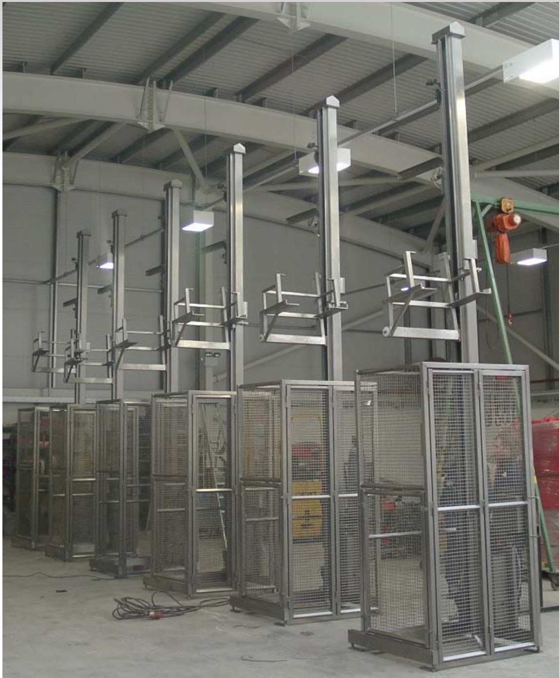
Single Pillar Guarded Crate Tipper

This single pillar guarded crate tipper is designed to lift and tip a single tray of salad (600 x 400 x 170mm High) at a height of 4150mm. The guarded crate tipper is constructed from Grade 304 stainless steel and is fully TIG welded throughout. The lifting is achieved by a food quality toothed timing belt driven by a motor gearbox mounted at the bottom of the main column. The guarded crate tipper is designed to be bolted to the floor.