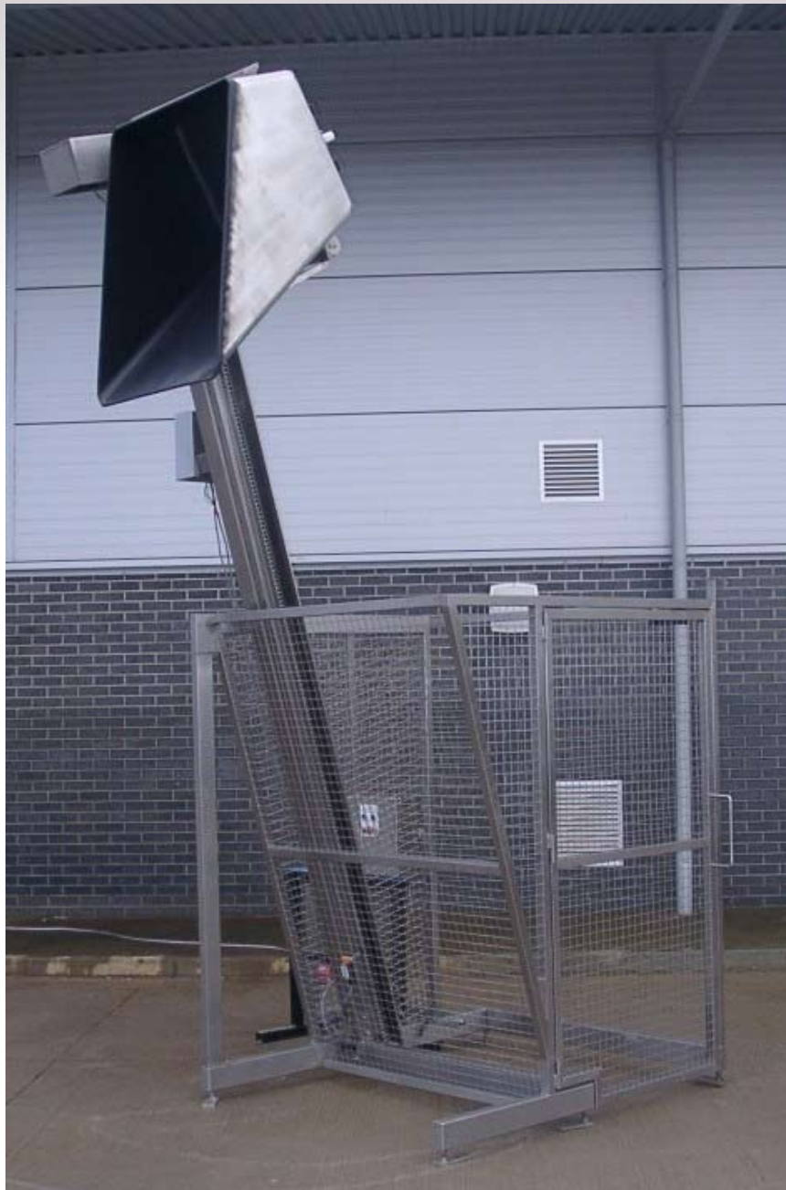
Single Pillar Guarded Skip Tipper

This single pillar guarded skip tipper was designed to lift and tip an integral skip at a height of 2750mm. The guarded skip tipper is constructed from Grade 304 stainless steel and is fully TIG welded throughout. The lifting is achieved via a chain driven by a motor gearbox mounted at the top of the main column. The guarded skip tipper is designed to be bolted to the floor.