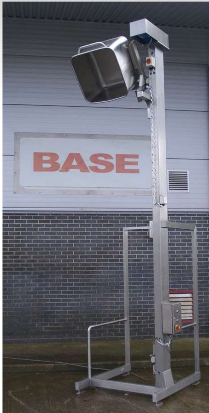
Tote Bin Lift for 200 Litre Tote Bin

The tote bin lift is a single pillar 200 Litre tote bin tipper that is designed to lift and tip at an adjustable discharge height of between 2700mm and 3700mm in 100mm increments. The tote bin lift is constructed from Grade 304 stainless steel, is fully TIG welded throughout and will operate on a 'dead mans handle' principle. Lifting with the tote bin lift is achieved by a 3/4" Simplex chain driven by a motor gearbox mounted at the top of the main column. The tote bin lift is designed to be bolted to the floor.