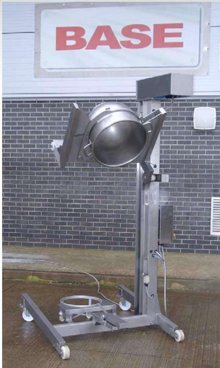
Mixing Bowl Tipper for Hobart Mixing Bowl

The mixing bowl tipper is a single pillar tipper that is designed to lift and tip a Hobart Mixing Bowl at a discharge height of 1525mm. The mixing bowl tipper is constructed from Grade 304 stainless steel, is fully TIG welded throughout and will operate on a 'dead mans handle' principle. Lifting with the mixing bowl tipper is achieved by a \frac{3}{4} " Simplex chain driven by a motor gearbox mounted at the top of the main column. The Hobart Mixing Bowl is wheeled into the lifting frame and is latched during the tipping operation. The mixing bowl tipper is designed to be mobile on two fixed and two swivel braked castors.