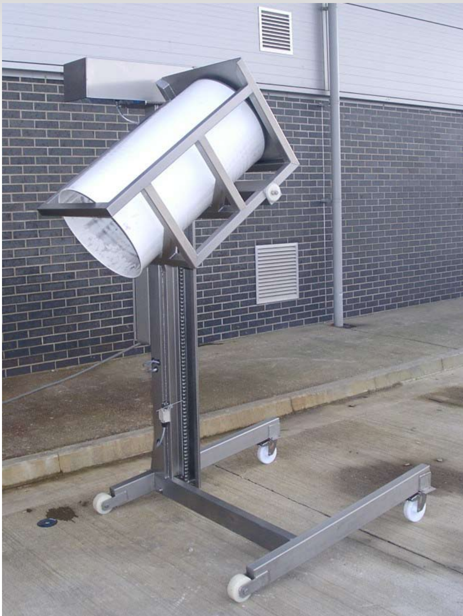
Mobile Drum Tipper for 200 Litre Drums

The mobile drum tipper is a single pillar 200 Litre steel drum tipper that is designed to lift and tip at a discharge height of 1250mm. The mobile drum tipper is constructed from Grade 316 stainless steel, is fully TIG welded throughout and will operate on a 'dead mans handle' principle. Lifting with the mobile drum tipper is achieved by a \frac{3}{4} " Simplex chain driven by a motor gearbox mounted at the top of the main column. The mobile drum tipper is designed to be mobile on two fixed and two swivel braked castors.