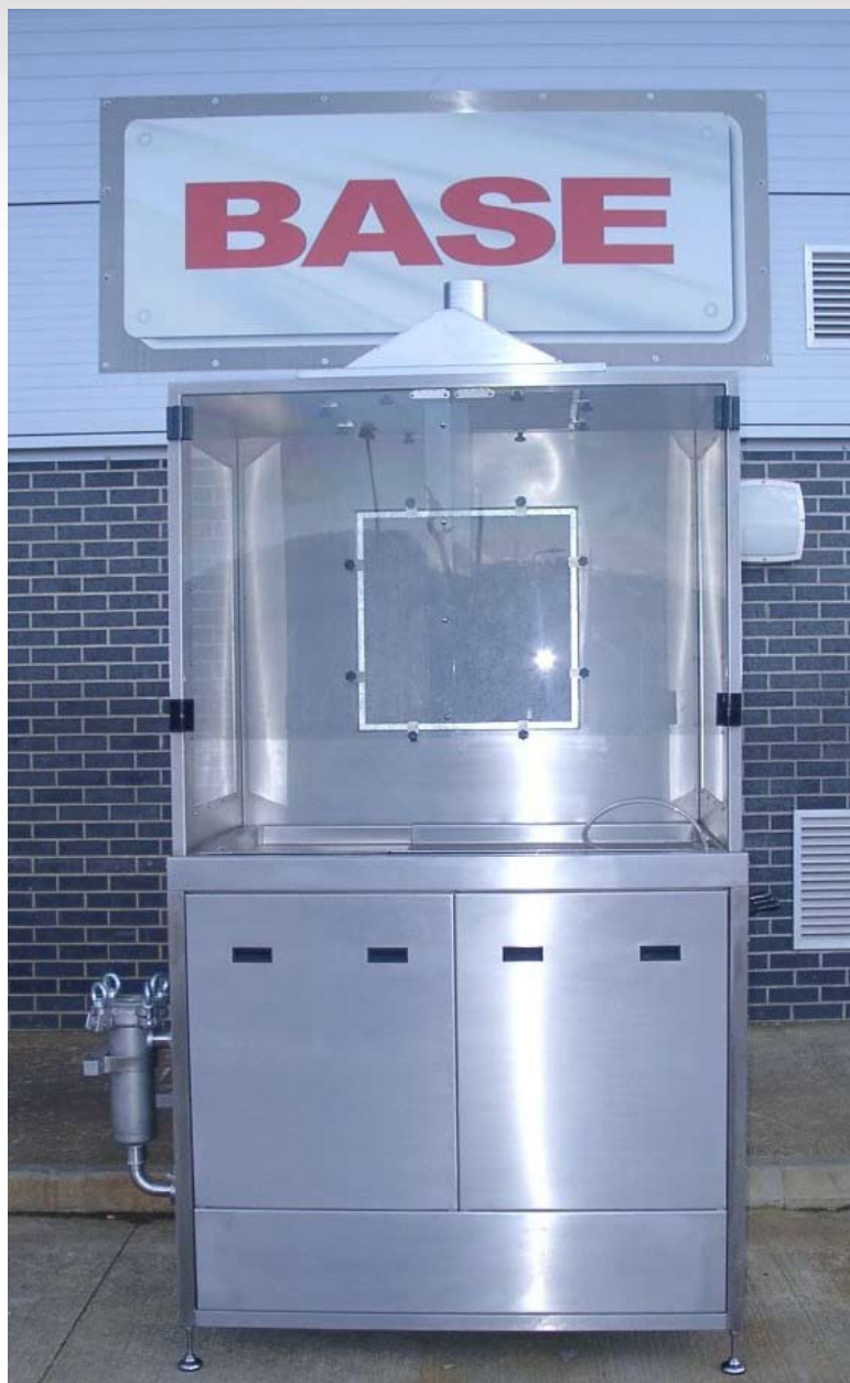
ATEX Wash Station

This ATEX Wash Station was designed to be used in an ATEX Zone 21, T4 environment to allow various items to be cleaned in a controlled environment. The unit had a working area of approximately 1000 x 500mm at a safe and convenient working height. The items to be cleaned were taken to the ATEX Wash Station and cleaned using a cleaning agent and a cleaning brush. The cleaning agent was pumped through a recirculating system via a diaphragm pump mounted below the work surface. The cleaning agent was passed through a disposable filter bag to remove any solids. At the back of the unit, there was an extraction duct to allow any cleaning agent fumes to be extracted away from the operator. The extraction duct was fitted with easy change disposable filter cartridges. The ATEX Wash Station was fabricated from Grade 304 stainless steel and was a hygienically welded construction.