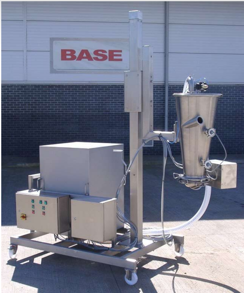
Ytron Quadro Sugar Transfer System

This sugar transfer system incorporates a manually operated lift to raise and lower the transfer hopper. The sugar transfer system is made from Grade 304 stainless steel box section and is fully TIG welded throughout. The sugar transfer system is mobile with two fixed and two swivel braked castors. The sugar is metered out of a bulk bag by a pneumatic Star valve into the air flow pipework. Air is allowed into the air flow pipework at the infeed end by an air filter. The outfeed end of this pipework is connected to the vacuum hopper. An air blower creates a negative air pressure and therefore suction in the vacuum hopper. At the base of the vacuum hopper is a second pneumatic star valve which controls the discharge of sugar from the vacuum hopper into the mixing vessel. The vacuum hopper also has non intrusive capacitance type High and Low Level control sensors.