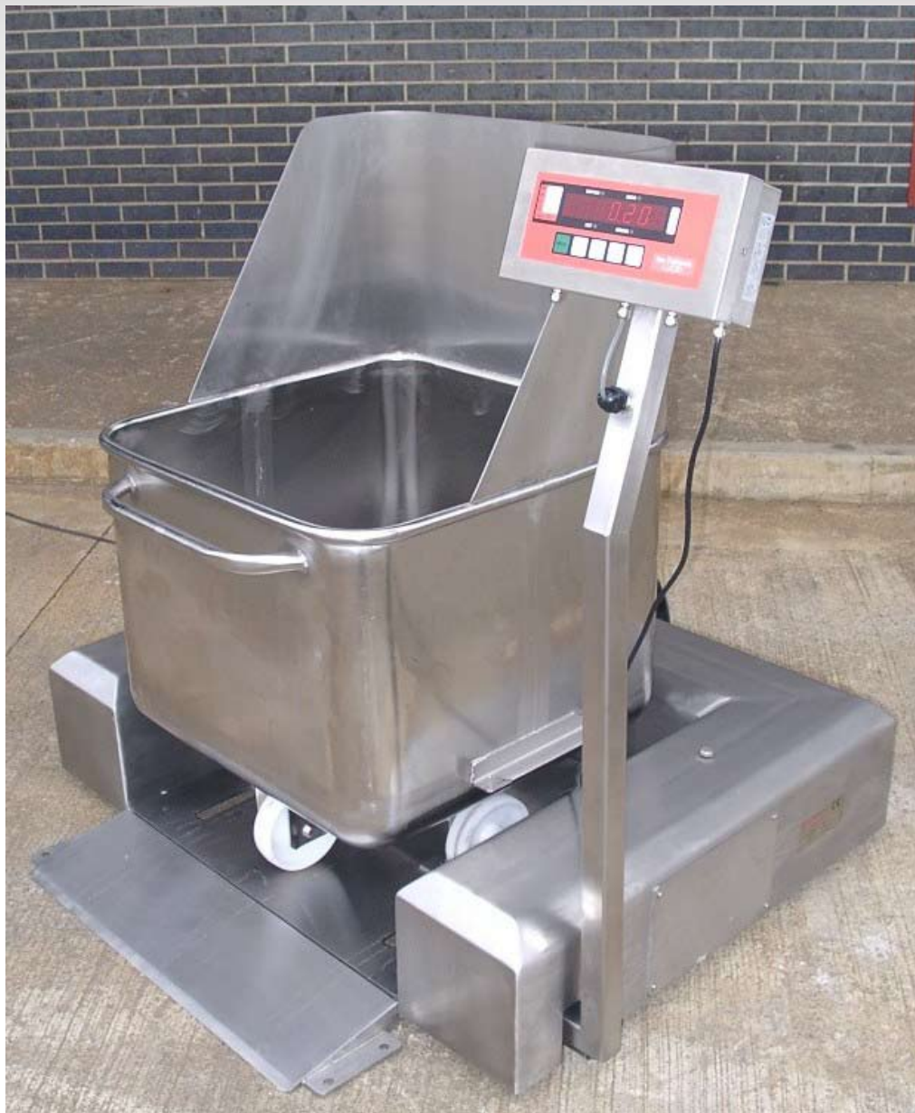
Tote Bin Weighing Platform for 200 Litre Tote Bin

This tote bin weighing platform is designed such that the tote bin is wheeled up a 25mm ramp and onto the lifting platform for weighing. The tote bin weighing platform can either be used to check a bins weight or to fill the bin accurately when it is on the platform. The tote bin weighing platform is constructed from Grade 304 stainless steel, is fully TIG welded throughout and is designed to be bolted to the floor. The tote bin weighing platform is fitted with three 500 Kgs Load Cells and a Ian Fellows Lucid display unit. All of the electrical equipment is mounted in enclosures rated to IP65.