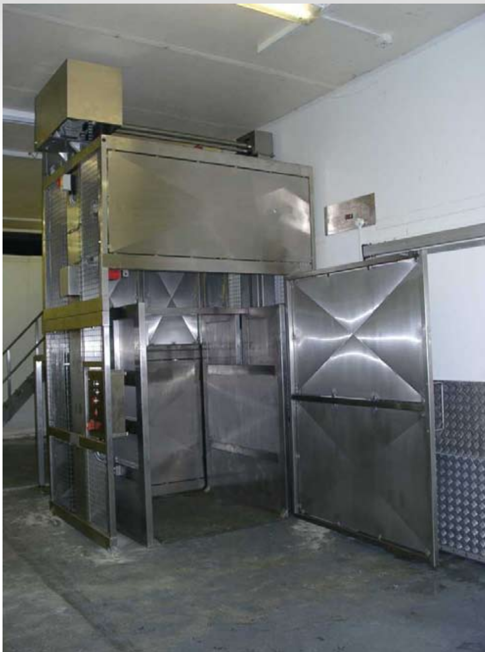
Double Pillar Guarded Pallet Lift for Standard Pallets

This guarded pallet lift is a double pillar machine with a Safe Working Load of 1000 Kgs and a lift height of 1410mm. The lifting platform will be big enough to allow a standard pallet (1200 x 1000mm) to be loaded using a hand pallet truck. At the upper level, the pallet was unloaded by hand by removing each individual sack. The guarded pallet lift was constructed from Grade 304 stainless steel and would be bolted to the floor. Lifting with this guarded pallet lift is accomplished via chains driven by a motor gearbox mounted at the top of the one column with a crossover shaft to the other column.