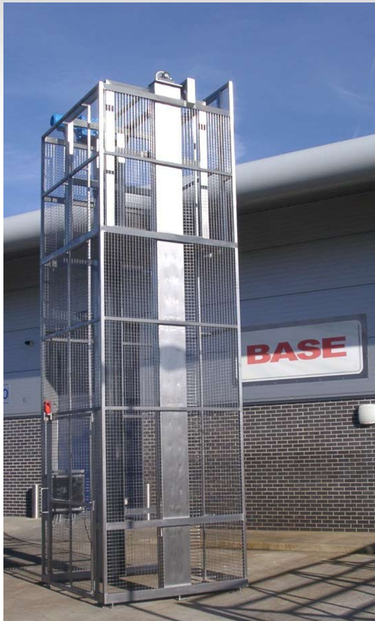
Double Pillar Goods Lift for Standard Pallets

This goods lift is a double pillar machine with a Safe Working Load of 1000 Kgs and a lift height of 4170mm. The lifting platform will be big enough to allow a standard pallet (1200 x 1000mm) to be loaded using a hand pallet truck. At the upper level, there will be a landing plate to allow easy unloading. The goods lift is constructed from Grade 304 stainless steel and would be bolted to the floor. Lifting with this goods lift is accomplished via chains driven by a motor gearbox mounted at the top of the one column with a crossover shaft to the other column.