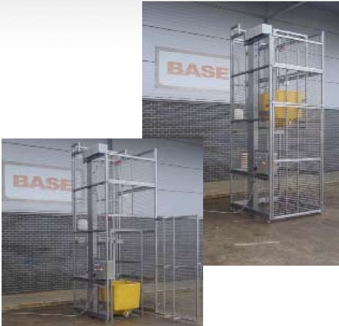
Single Pillar Tote Bin Platform Lift for 200 Litre Tote Bins

This tote bin platform lift is a single pillar machine with a Safe Working Load of 300 Kgs and a lift height of 2280mm. The lifting platform is big enough to allow a standard tote bin to be loaded by being wheeled onto the lifting platform. At the upper level, there will be a landing plate to allow easy unloading. The tote bin platform lift is constructed from Grade 304 stainless steel and is bolted to the floor and braced at the upper level. Lifting with the tote bin platform lift is accomplished via a chain driven by a motor gearbox mounted at the top of the main column.