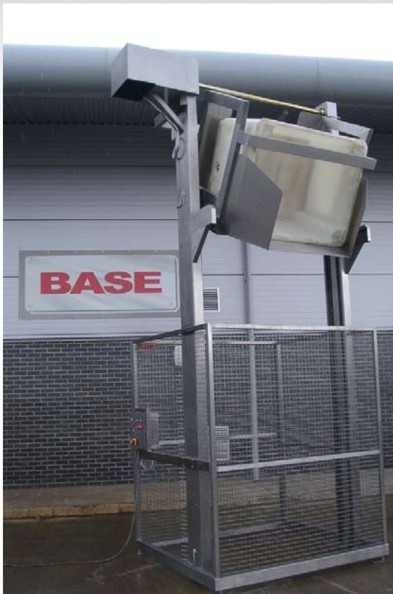
Double Pillar Lifter for 680 Litre Container

This double pillar lifter is designed to lift and tip a 680 Litre container (1020 x 820 x 1210mm High) at a discharge height of 3200mm. The double pillar lifter is constructed from Grade 304 stainless steel and is fully TIG welded throughout. Lifting with the double pillar lifter is accomplished via chains driven by a motor gearbox mounted at the top of the one column with a crossover shaft to the other column. This double pillar lifter is designed to be bolted to the floor.