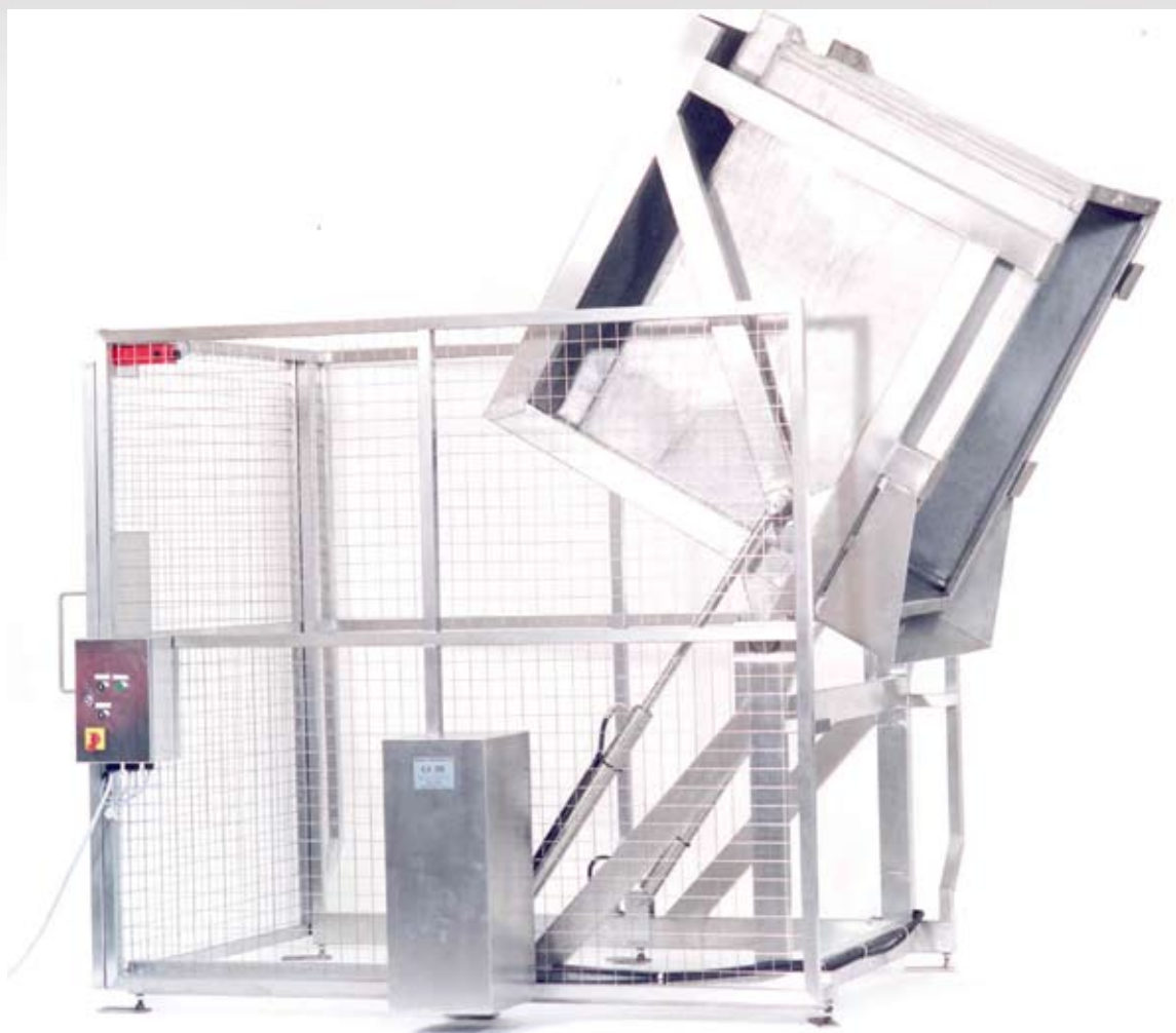
Hydraulic Dolaf Tipper for 1200 Litre Dolaf Bin

This hydraulic dolaf tipper is designed to lift and tip a 1200 Litre Dolaf bin at a height of 1000mm. The hydraulic dolaf tipper is constructed from Grade 304 stainless steel and is a fully TIG welded construction throughout. This hydraulic dolaf tipper would be powered via a hydraulic power pack and would tip the containers by the extension of a pair of stainless steel hydraulic cylinders. The hydraulic dolaf tipper will operate on a 'dead mans handle' principle and is designed to be bolted to the floor. The hydraulic cylinders will be fitted with hydraulic fuses to prevent the bin from falling in the unlikely event of a hose failure.