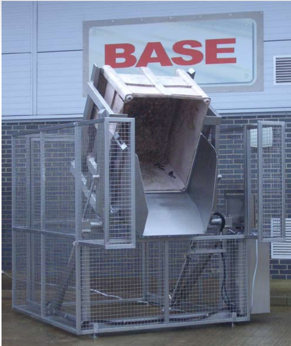
Guarded Bin Tipper for 600 Litre Dolaf Bin

This guarded bin tipper is designed to lift and tip a 600 Litre Dolaf bin at a height of 1000mm. The guarded bin tipper is constructed from Grade 304 stainless steel and is a fully TIG welded construction throughout. This guarded bin tipper would be powered via a hydraulic powerpack and would tip the containers by the extension of a pair of stainless steel hydraulic cylinders. The guarded bin tipper will operate on a 'dead mans handle' principle and is designed to be bolted to the floor. The hydraulic cylinders will be fitted with hydraulic fuses to prevent the bin from falling in the unlikely event of a hose failure.