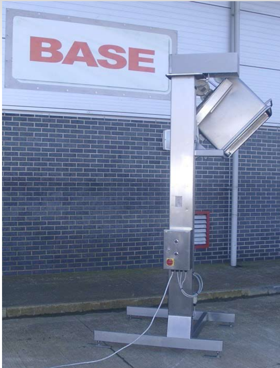
Bolted Bin Tipper for 200 Litre Tote Bin

The bolted bin tipper is a single pillar 200 Litre tote bin tipper that is designed to lift and tip at a discharge height of 1800mm. The bolted bin tipper is constructed from Grade 304 stainless steel, is fully TIG welded throughout and will operate on a 'dead mans handle' principle. Lifting with the bolted bin tipper is achieved by a \frac{3}{4} " Simplex chain driven by a motor gearbox mounted at the top of the main column. The bolted bin tipper is designed to be bolted to the floor.