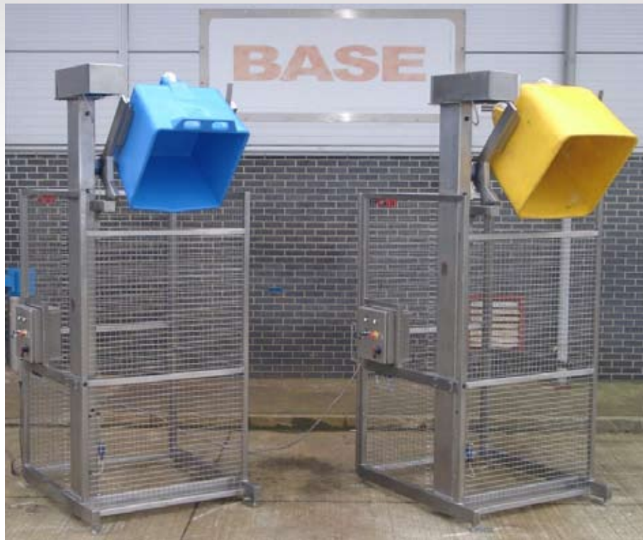
Single Pillar 200 Litre Eurobin Lift

This Eurobin Lift is a single pillar 200 Litre Eurobin Lift that is designed to lift and tip at a discharge height of 2050mm. The Eurobin Lift is constructed from Grade 304 stainless steel and is fully TIG welded throughout. Lifting with the Eurobin Lift is achieved by a \frac{3}{4} " Simplex chain driven by a motor gearbox mounted at the top of the main column. This Eurobin Lift is designed to be bolted to the floor.